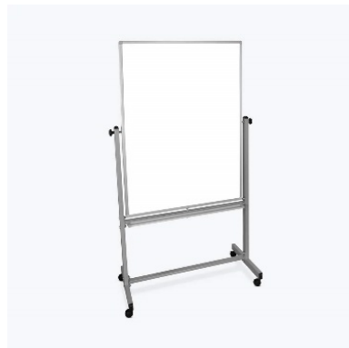
WHITEBOARD (VERTICAL) 36"W X 48"H + FRAME