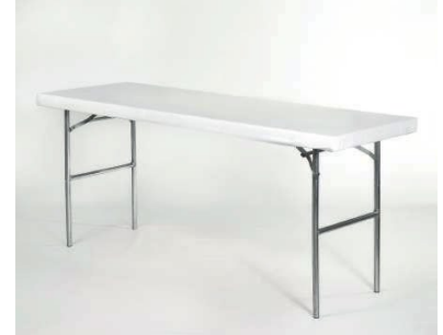
UNDRAPED TABLE/COUNTER 2' W X (4', 6', OR 8' L) X 30" H OR 40" H