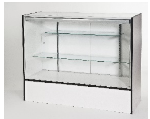
GLASS SHOW CASE 38" H X 48" W X 18" D