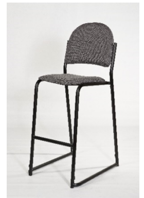
UPHOLSTERED BAR STOOL