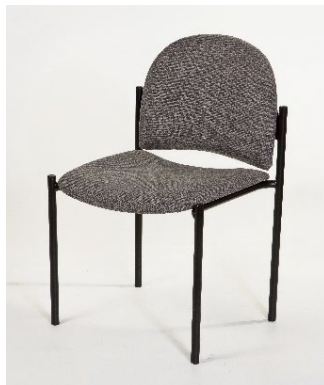
PADDED SIDE CHAIR