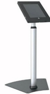
IPAD STAND WITH ADJUSTABLE POLE (28" - 44") BASE 18" X 14"