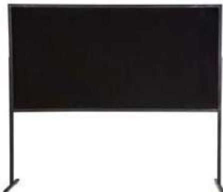
POSTER BOARD (HORIZONTAL) 4' X 8'