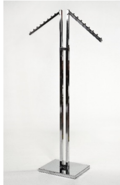
WATERFALL BAG RACK 50" H X 15" W X 12" L