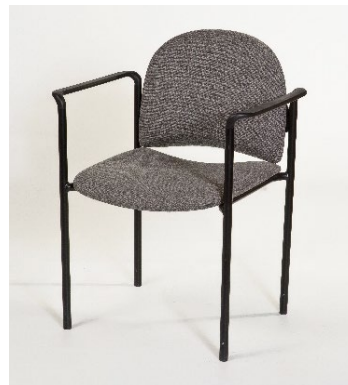
PADDED ARM CHAIR