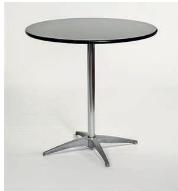
ROUND CONFERENCE TABLE/COUNTER 36" D (BLACK/WHITE) or 40" D (GREY) x 30" or 40" H