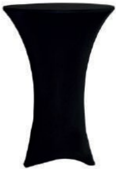
SPANDEX HIGHBOY 30" D X 40" H