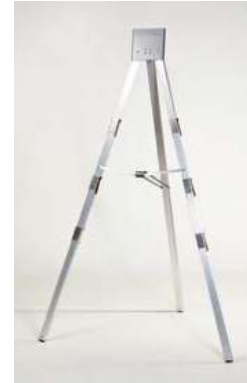
ALUMINUM EASEL 64" H X 32" W X 32" L