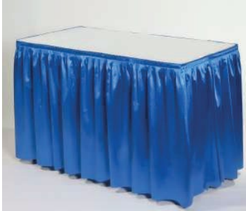
DRAPED TABLE 2' W X (4', 6', OR 8' L) X 30" H