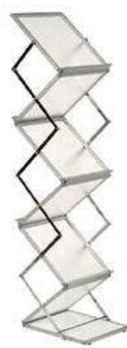
ACCORDION LITERATURE STAND 5' HIGH