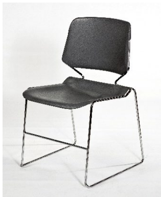
MOLDED PLASTIC CHAIR