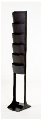
FLAT LITERATURE STAND WITH 6 POCKETS 55" H X 14" W X 9" L