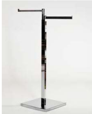
T STYLE BAG RACK 50" H X 15" W X 12" L