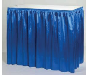
DRAPED COUNTER 2' W X (4', 6', OR 8' L) X 40" H